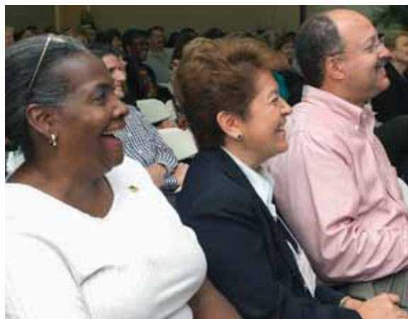
More than 300 attended the annual conference.

These were some of the issues explored at The Melissa Institute's Eighth Annual Conference, held on May 7, 2004. More than 300 psychologists, social workers, school counselors, law enforcement professionals and