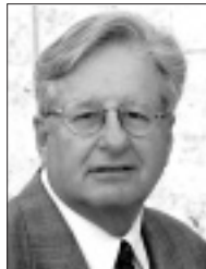
Donald Meichenbaum, Ph.D.

Donald Meichenbaum, Ph.D. , is Distinguished Professor Emeritus at the University of Waterloo, Ontario, and Research Director of The Melissa Institute. He is one of the founders of cognitive behavior therapy, and in a survey of North American clinicians Dr. Meichenbaum was voted "one of the 10 most influential psychotherapists of the century." He is a Distinguished Visiting Professor at the University of Miami.